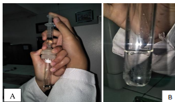
Fig. 2: A= Filtering process of semen diluents enriched with Indigofera Sp. ; B= filtering results.

NFSD=Non-Filtrated Semen Diluent; FSD =Filtrated Semen Diluent.