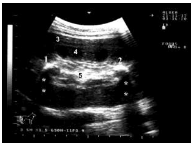
Fig. 3: Nephrolithiasis (1 and 2) in a female camel with red urine for a 6-month period. 3, renal cortex; 4, renal medulla; 5, renal sinus. Stars point to acoustic shadowing under the calculi.