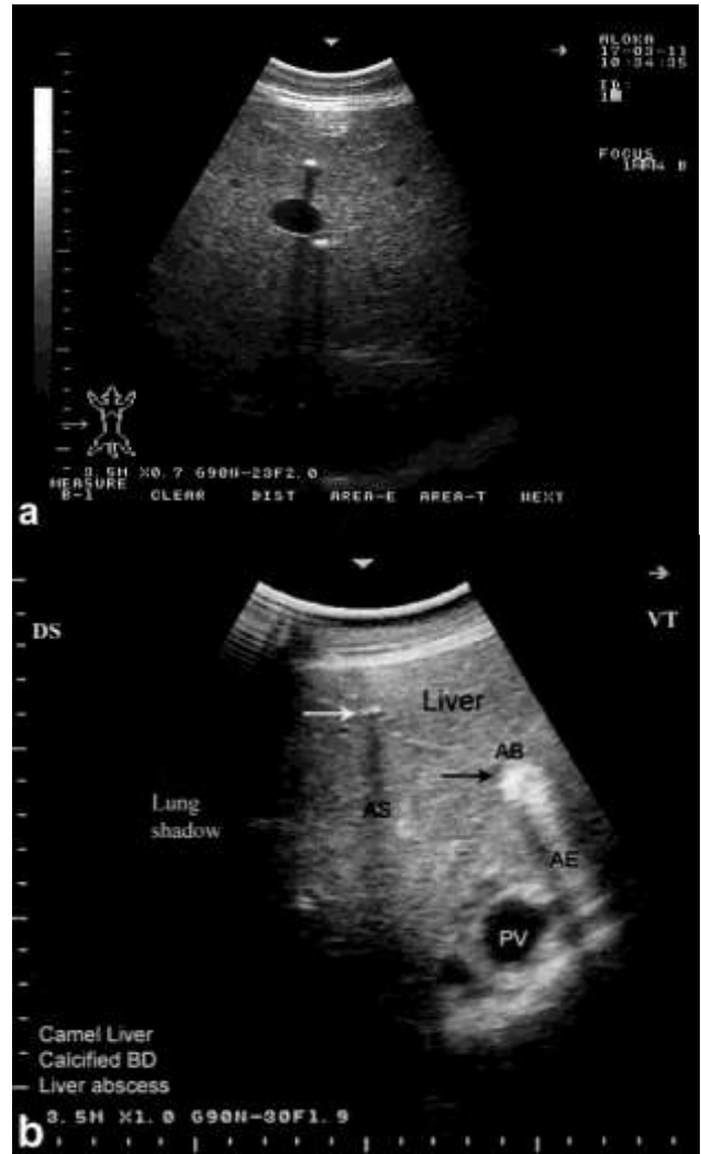
Fig. 2: Calcified bile ducts and hepatic abscess detected by ultrasonography in 2 apparent healthy camels. Intense echoes are imaged accompanied by a distal acoustic shadow (a, b). AS, acoustic shadowing; AB, abscess; PV, portal vein. Arrow in image b points to the calcified bile duct.

Disorders of kidney are numerous in camels. In an abattoir survey, kidney lesions included medullary hyperemia, renal capsular pigmentation, cortical and medullary discoloration, subcapsular calcification, nephrolithiasis, hydatidosis, hemorrhages in renal pelvis. In addition, acute tubular necrosis, capsular melanosis, caseous necrosis, chronic interstitial nephritis, medullary hyperemia, calcification and hydatid cyst were confirmed histologically (Kojouri et al. 2014). Sonographically, some disorders were reported to be imaged such as urolithiasis. A urinary calculi are imaged in camels as an enhanced echo with distal black shadow