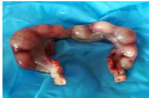
Fig. 1: Uterus of queen with pyometra after ovariohysterectomy.

Animals of group D were subjected to ovariohysterectomy under general anesthesia induced with Xylazine 2% at 0.15 ml/kg BW dose (Woerden, Holland) and maintained with ketamine 10% at 15mg/kg BW dose (Woerden, Holland). After restraining the animal in dorsal recumbency for a ventral midline celiotomy, ventral abdomen was closely clipped, and aseptic surgery was performed. Ovariohysterectomy was performed and both ovaries and horns of the uterus were removed (Fig. 1). No complication was noted after the operation and the sutures were removed on the 14th day, when the surgical site was healed completely.