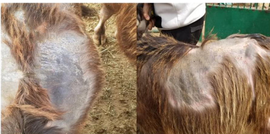
Fig. 2: Skin lesions and alopecia over dorsum and lateral abdomen in zinc deficient buffalo calves (G1) group.